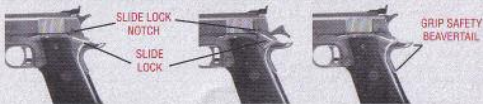
FIGURE 1. SLIDE LOCK NOTCH

The slide lock safety, Figure 1, can only be engaged when the slide is fully forward and the hammer is fully cocked. The slide lock safety prevents rearward motion of the slide and engages the sear to prevent forward hammer movement when the trigger is squeezed. The grip safety, figure 2, is automatically engaged to prevent rearward trigger motion until the pistol grip is firmly and properly grasped.